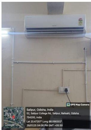
A. C (4 Star) UGC